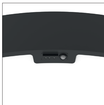
XC daylight&occ sensor

All current index numbers, lumen outputs, power consumption and many other technical information are available in our 2024 pricelist. Details on wireless lighting control systems on page number 896.