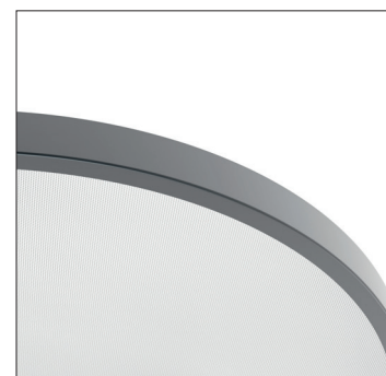
MP19H microprismatic diffuser