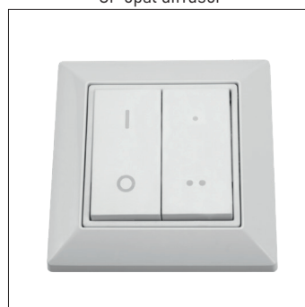
XCS wireless switch